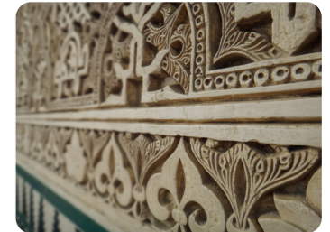
relief wall decoration

Relief sculpture is any work where an image or pattern is raised from a surface. If only slightly raised, the sculpture is called low relief or 'bas-relief'. If the image or pattern is almost three dimensional but is still attached to the background, the sculpture is called high relief or 'alto-relief'. Islamic architectural surfaces are often decorated with low and high relief sculptures.