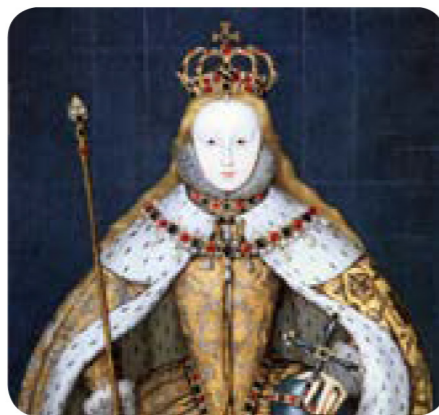
Coronation Portrait by unknown artist, c1600