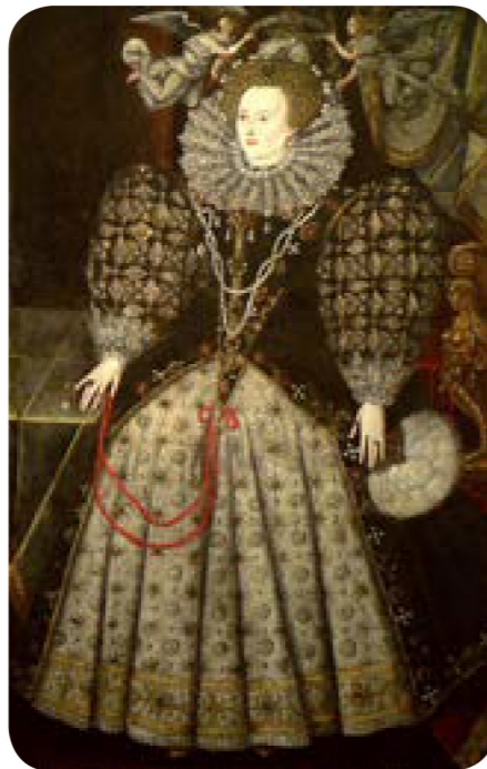
Portrait of Elizabeth I of England attributed to Nicholas Hilliard, 1590